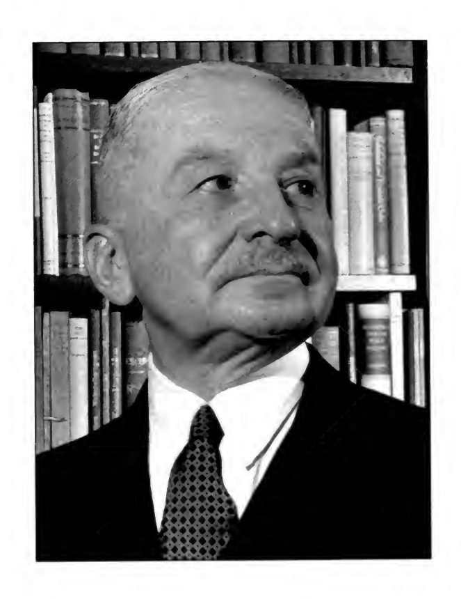
LUDWIG VON MISES